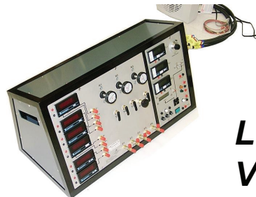
Low Flow Valve Test Stand

GOVERNING CERTIFICATIONS / APPROVALS •FAA Repair Agency # VDTR380K •European Union – EASA.145.4512 •Peoples Republic of China – CAAC F00100407 •Indonesia – DGAC #1452840001 •Thailand – Dept. of Civil Aviation # 329/2547 •US - Canada Military Certificate – DD2345